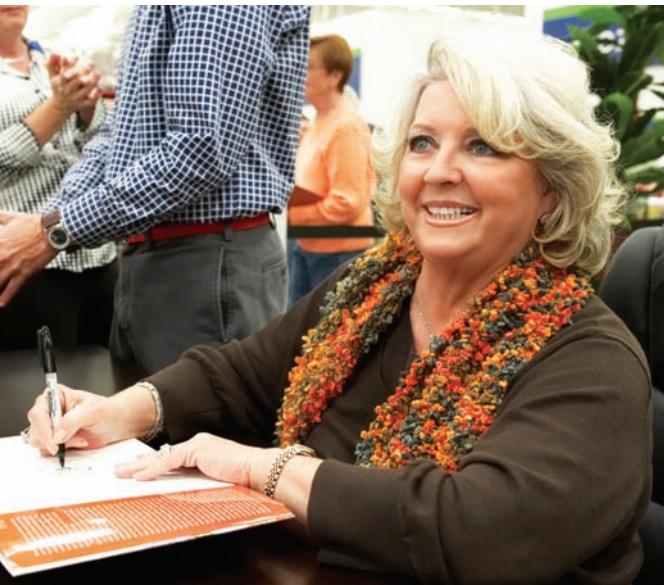
▼ Paula goes on the road to promote her new cookbook Paula Deen Celebrates!